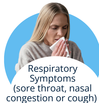
Respiratory Symptoms (sore throat, nasal congestion or cough)