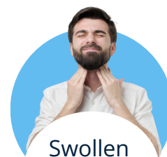
Swollen lymph nodes

If you have symptoms, isolate from others and contact a healthcare provider right away.