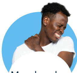
Muscle aches & backache